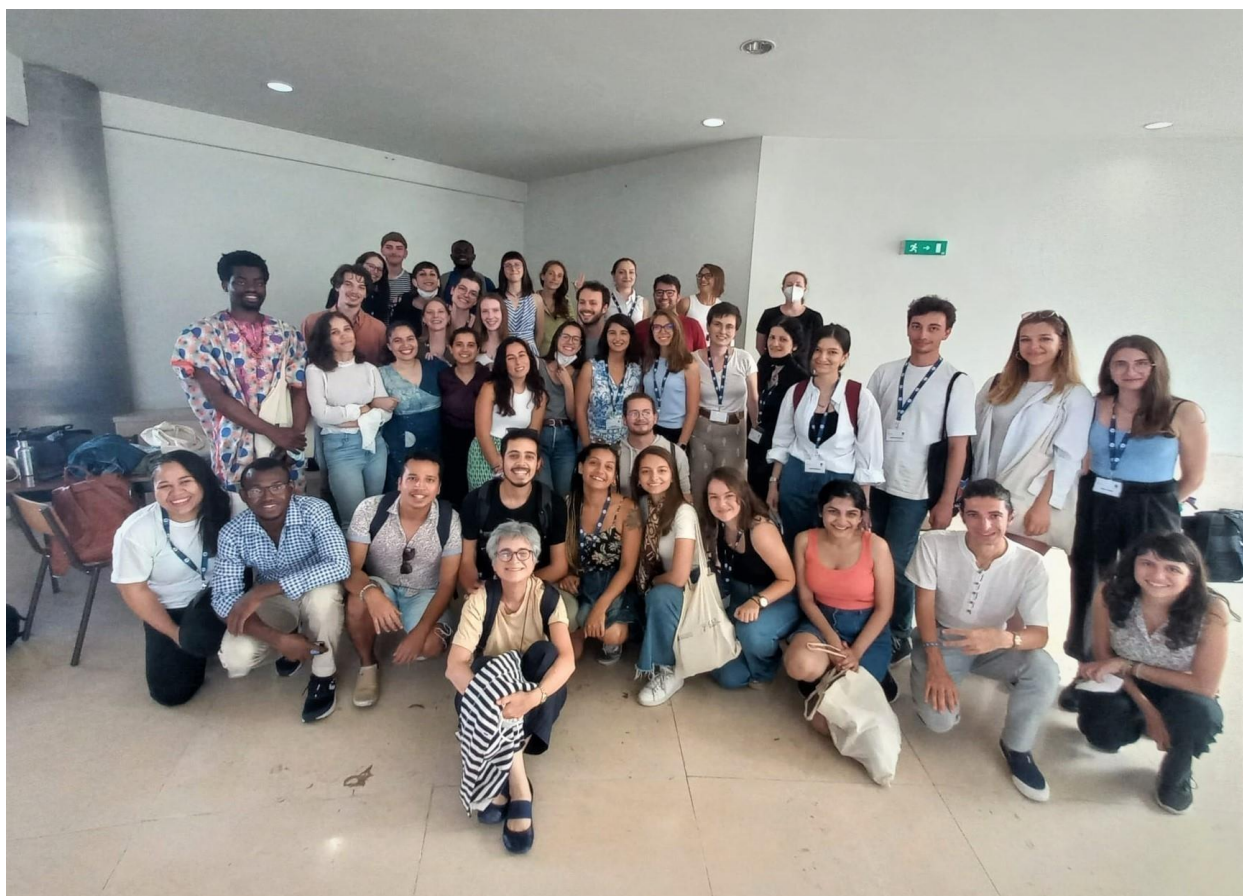
Studenti Erasmus Mundus CLE – Lauree Lisbona